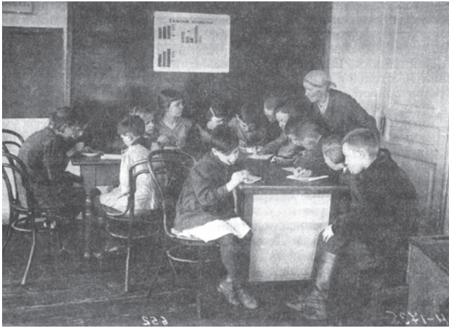
Fig.15 – Children at school in Soviet Russia in the 1930s.