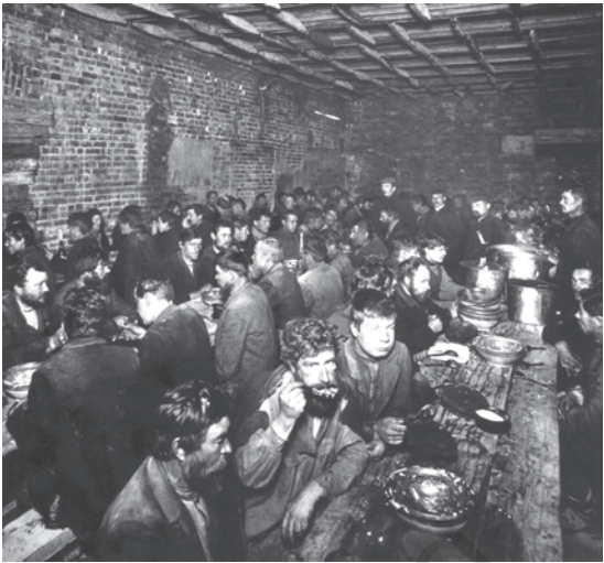
Fig.5 – Unemployed peasants in pre-war St Petersburg. Many survived by eating at charitable kitchens and living in poorhouses.

In the countryside, peasants cultivated most of the land. But the nobility, the crown and the Orthodox Church owned large properties. Like workers, peasants too were divided. They were also