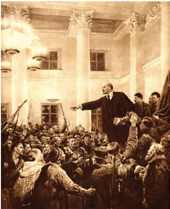
Fig.9 – A Bolshevik image of Lenin addressing workers in April 1917.

Meanwhile in the countryside, peasants and their Socialist Revolutionary leaders pressed for a redistribution of land. Land committees were formed to handle this. Encouraged by the Socialist Revolutionaries, peasants seized land between July and September 1917.