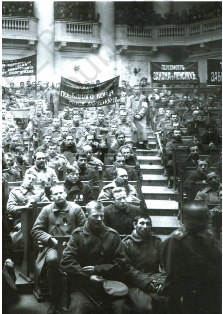
Fig. 8 – The Petrograd Soviet meeting in the Duma, February 1917.

On Sunday, 25 February, the government suspended the Duma. Politicians spoke out against the measure. Demonstrators returned in force to the streets of the left bank on the 26th. On the 27th, the Police Headquarters were ransacked. The streets thronged with people raising slogans about bread, wages, better hours and democracy. The government tried to control the situation and called out the cavalry once again. However, the cavalry refused to fire on the demonstrators. An officer was shot at the barracks of a regiment and three other regiments mutinied, voting to join the striking workers. By that evening, soldiers and