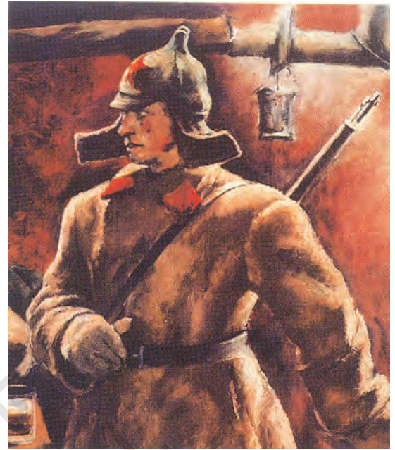
Fig. 12 – A soldier wearing the Soviet hat ( budeonovka ).

The Bolshevik Party was renamed the Russian Communist Party (Bolshevik). In November 1917, the Bolsheviks conducted the elections to the Constituent Assembly, but they failed to gain majority support. In January 1918, the Assembly rejected Bolshevik measures and Lenin dismissed the Assembly. He thought the All Russian Congress of Soviets was more democratic than an assembly elected in uncertain conditions. In March 1918, despite opposition by their political allies, the Bolsheviks made peace with Germany at Brest Litovsk. In the years that followed, the Bolsheviks became the only party to participate in the elections to the All Russian Congress of Soviets, which became the Parliament of the country. Russia became a one-party state. Trade unions were kept under party control. The secret police (called the Cheka first, and later OGPU and NKVD) punished those who criticised the Bolsheviks. Many young writers and artists rallied to the Party because it stood for socialism and for change. After October 1917, this led to experiments in the arts and architecture. But many became disillusioned because of the censorship the Party encouraged.