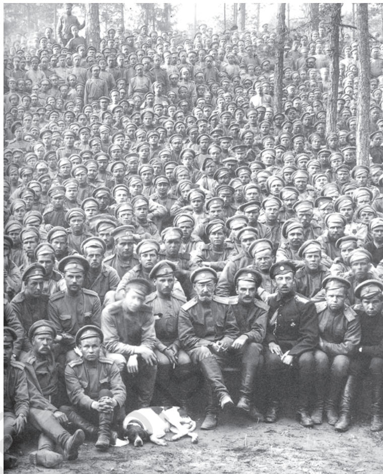
Fig. 7 – Russian soldiers during the First World War.

The war also had a severe impact on industry. Russia's own industries were few in number and the country was cut off from other suppliers of industrial goods by German control of the Baltic Sea. Industrial equipment disintegrated more rapidly in Russia than elsewhere in Europe. By 1916, railway lines began to break down. Able-bodied men were called up to the war. As a result, there were labour shortages and small workshops producing essentials were shut down. Large supplies of grain were sent to feed the army. For the people in the cities, bread and flour became scarce. By the winter of 1916, riots at bread shops were common.