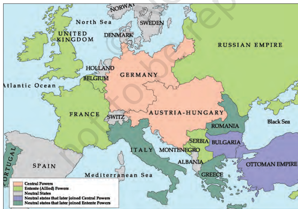
Fig.4 – Europe in 1914.

The map shows the Russian empire and the European countries at war during the First World War.