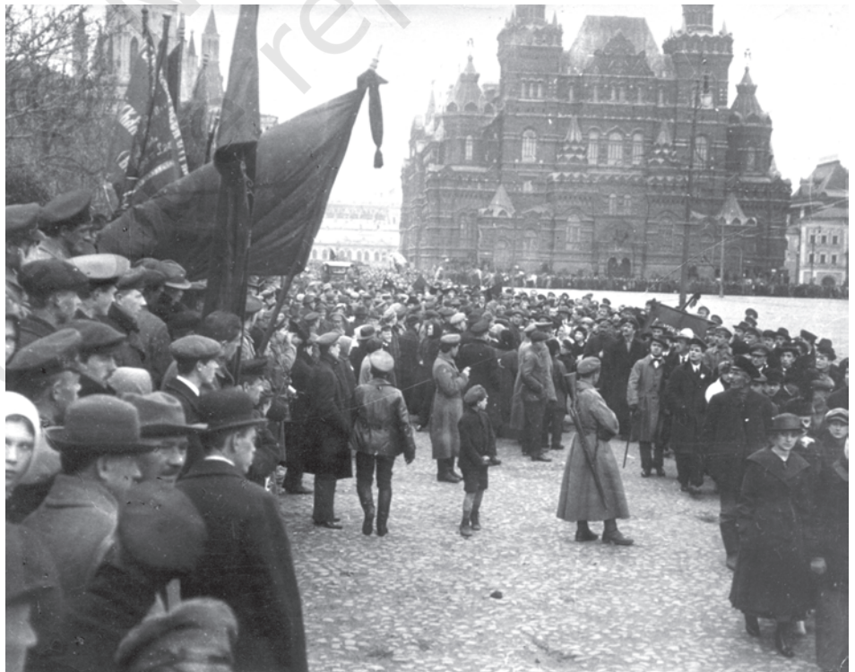
Fig. 13 – May Day demonstration in Moscow in 1918.