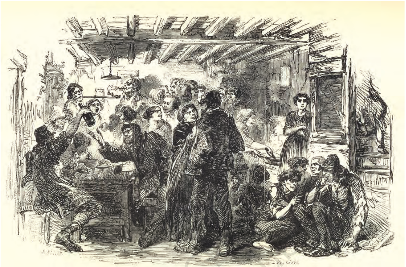
Fig. 1 – The London poor in the mid-nineteenth century as seen by a contemporary.

From: Henry Mayhew, London Labour and the London Poor, 1861.