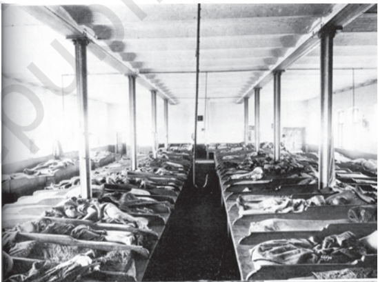
Fig.6 – Workers sleeping in bunks in a dormitory in pre-revolutionary Russia. They slept in shifts and could not keep their families with them.