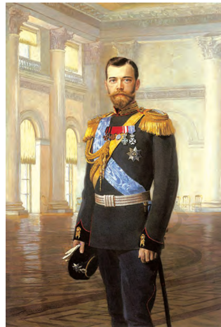
Fig.3 – Tsar Nicholas II in the White Hall of the Winter Palace, St Petersburg, 1900. Painted by Ernest Lipgart (1847-1932)

In 1914, Tsar Nicholas II ruled Russia and its empire. Besides the territory around Moscow, the Russian empire included current-day Finland, Latvia, Lithuania, Estonia, parts of Poland, Ukraine and Belarus. It stretched to the Pacific and comprised today's Central Asian states, as well as Georgia, Armenia and Azerbaijan. The majority religion was Russian Orthodox Christianity – which had grown out of the Greek Orthodox Church – but the empire also included Catholics, Protestants, Muslims and Buddhists.