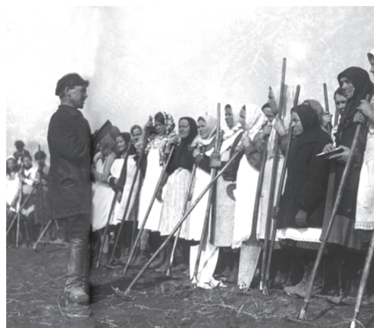
Fig. 19 – Peasant women being gathered to work in the large collective farms.