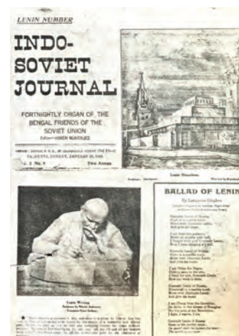
Fig.20 – Special Issue on Lenin of the Indo-Soviet Journal.