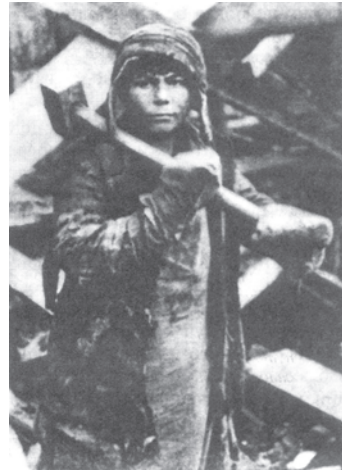
Fig.16 – A child in Magnitogorsk during the First Five Year Plan.