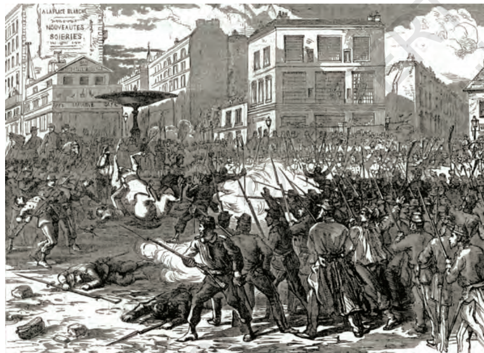
Fig.2 – This is a painting of the Paris Commune of 1871 (From Illustrated London News, 1871). It portrays a scene from the popular uprising in Paris between March and May 1871. This was a period when the town council (commune) of Paris was taken over by a ‘peoples’ government’ consisting of workers, ordinary people, professionals, political activists and others. The uprising emerged against a background of growing discontent against the policies of the French state. The ‘Paris Commune’ was ultimately crushed by government troops but it was celebrated by Socialists the world over as a prelude to a socialist revolution. The Paris Commune is also popularly remembered for two important legacies: one, for its association with the workers’ red flag – that was the flag adopted by the communards ( revolutionaries) in Paris; two, for the ‘Marseillaise’, originally written as a war song in 1792, it became a symbol of the Commune and of the struggle for liberty.