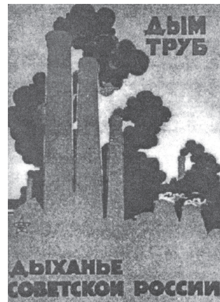
Fig. 14 – Factories came to be seen as a symbol of socialism. This poster states: 'The smoke from the chimneys is the breathing of Soviet Russia.'

An extended schooling system developed, and arrangements were made for factory workers and peasants to enter universities. Crèches were established in factories for the children of women workers. Cheap public health care was provided. Model living quarters were set up for workers. The effect of all this was uneven, though, since government resources were limited.