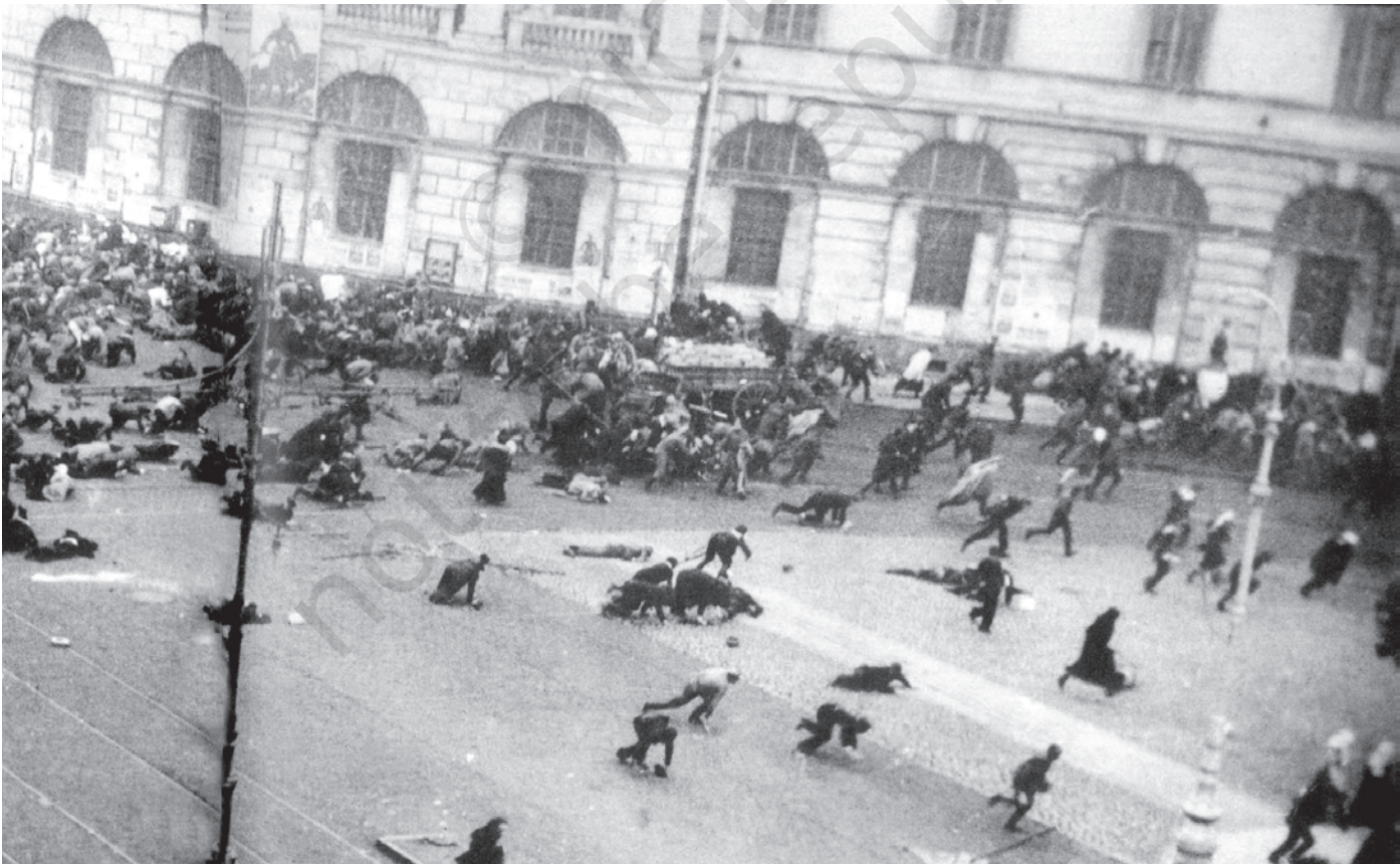
Fig.10 – The July Days. A pro-Bolshevik demonstration on 17 July 1917 being fired upon by the army.