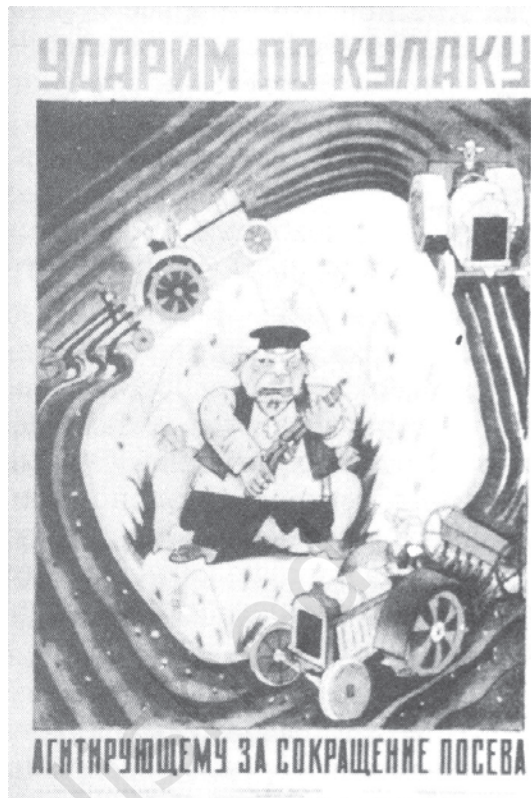
Fig. 18 – A poster during collectivisation. It states: 'We shall strike at the kulak working for the decrease in cultivation.'

Exiled – Forced to live away from one's own country.