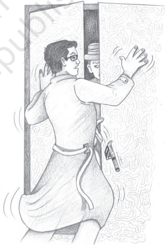
Gerrard gives him a push into the cupboard ...

GERRARD : I have got a man posted on the main road. He'll ring up if he sees the